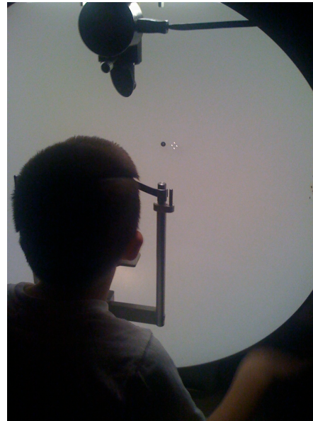
A child with BCM during a clinical examination

These projects are performed as part of day by day activities by Directors and Volunteers. A Patient Registry for BCM is one of our main goal.